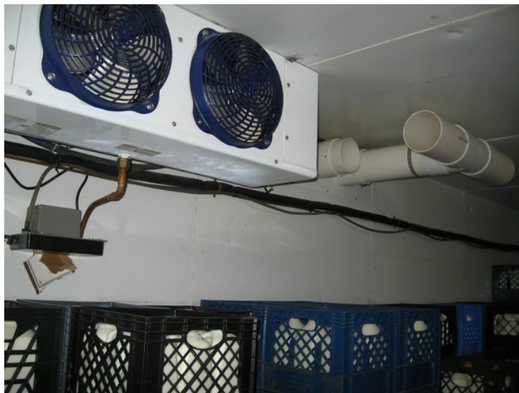
Walk-in cooler with outside air economizer and high efficiency fans, at Mapleline Farm in Hadley

Visit the Technical Resources section of our website for more details about energy efficient refrigeration. Visit the Energy Efficiency Tips for Farms section for lots of other good information