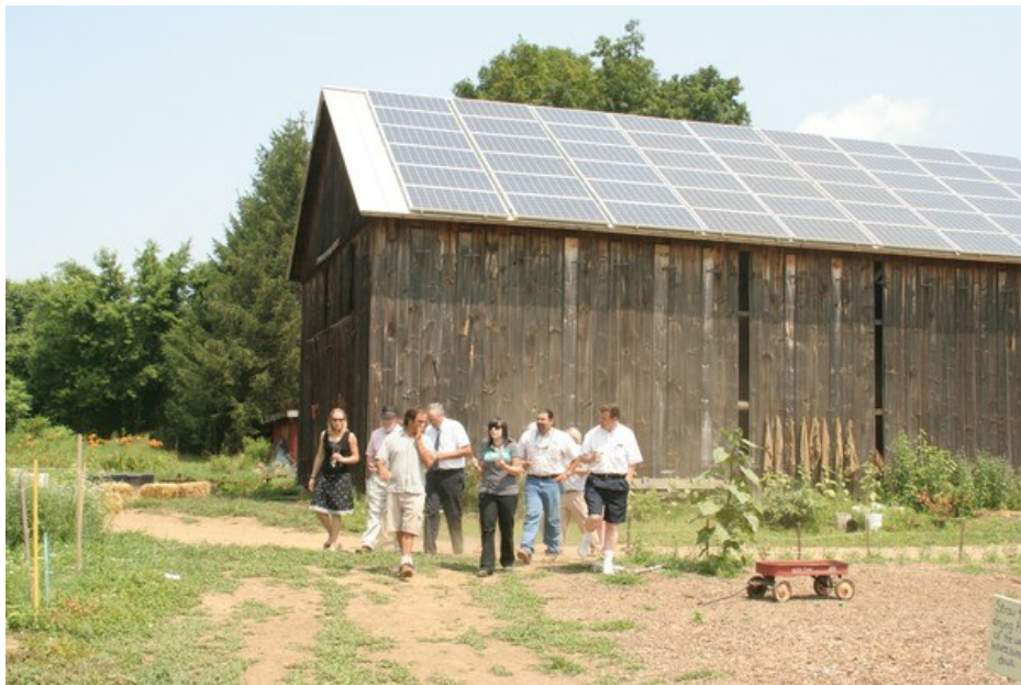
Green Energy Tour, including a roof-mounted photovoltaic system and super insulated cold storage, at Winter Moon Farm in Hadley

If you have any questions, contact your local NRCS field office.