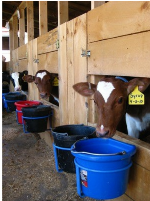
Calves on the Gunn Farm in Sunderland