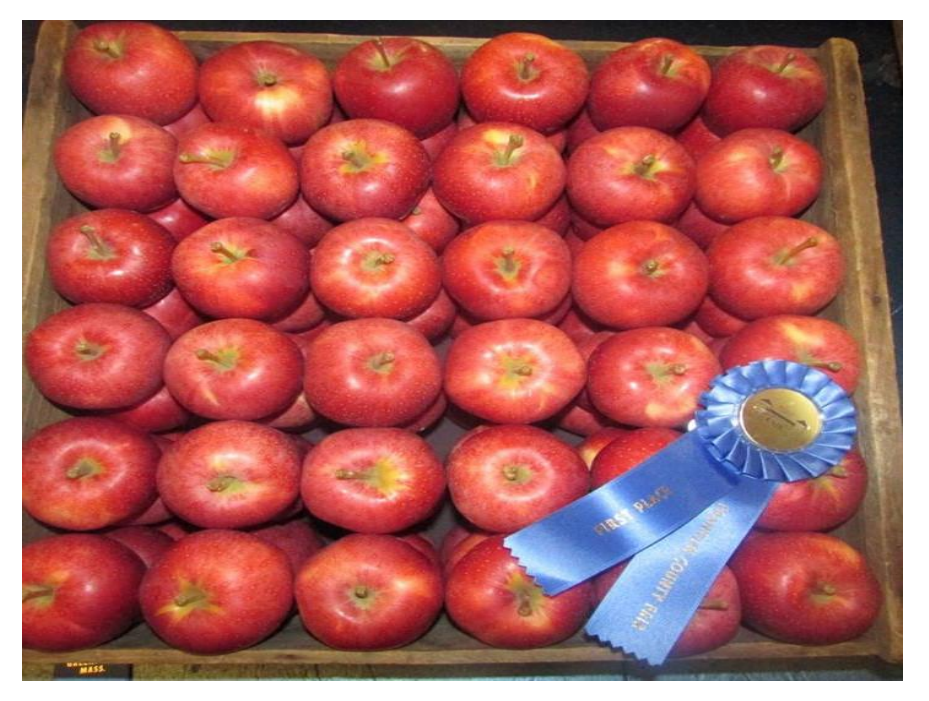
Apples from Clarkdale Fruit Farms in Deerfield