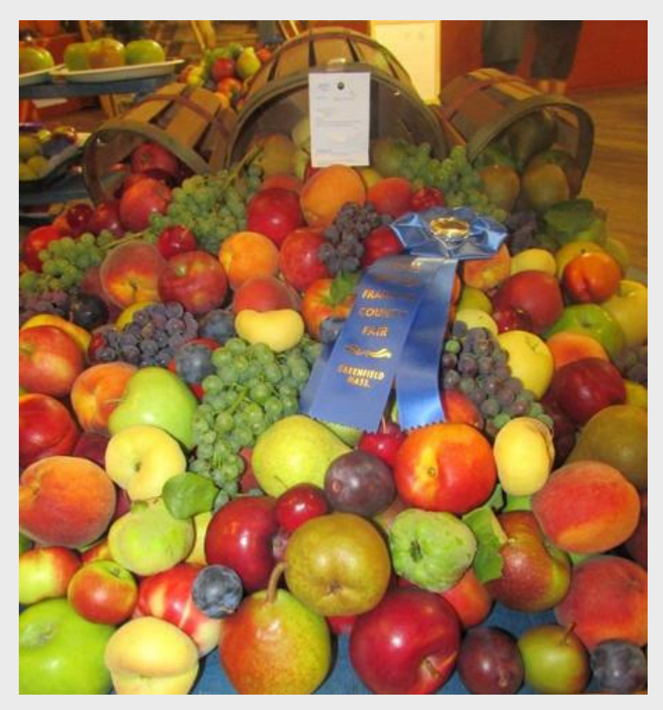
A blue ribbon wining display of produce at the Franklin County Fair in Greenfield.